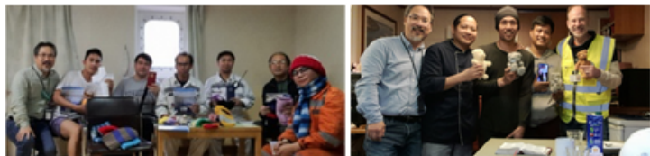
A first worship service on board