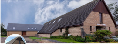
Montrose Baptist Church

MBF is small welcoming church on the northern edge of Montrose. Worship is every Sunday at 10.45 a.m. for approximately 1 hour. Communion is celebrated on the 1st and 3rd Sundays in each month.